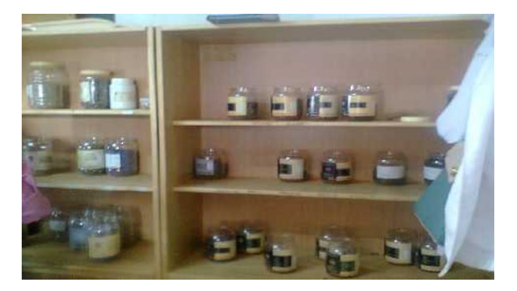
Fig.3. Empty Medicine Containers in the National Traditional Medicine Hospital.